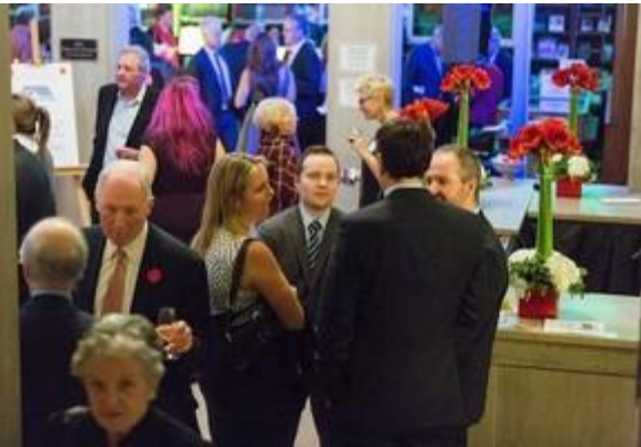
Guests socializing at our 2016 event